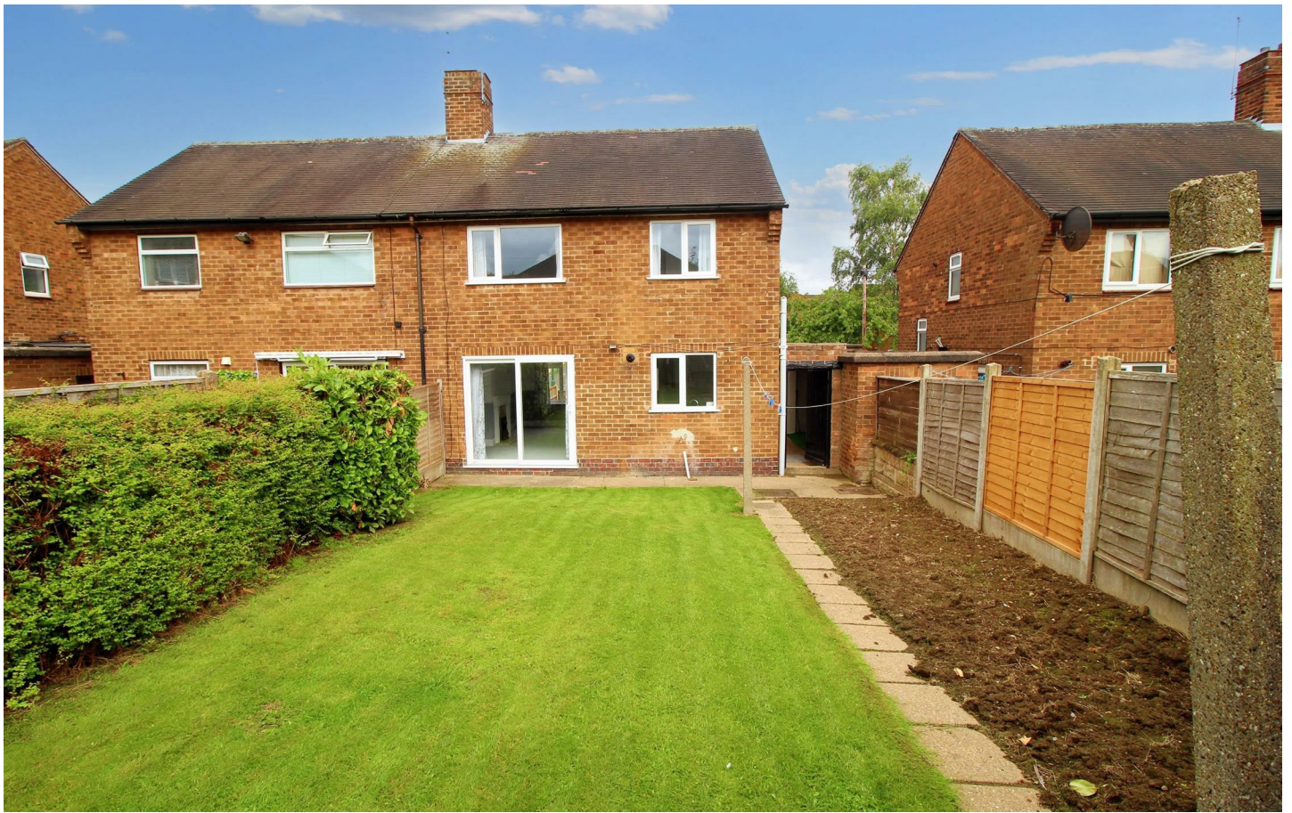
A Beautifully Presented Three-Bedroom Semi-Detached House.

Situated in this popular and convenient residential location, readily accessible for a wide range of local shops and amenities including; schools and transport links, this fantastic property is considered an ideal opportunity for a variety of potential purchasers including; first time buyers, young professionals and families.